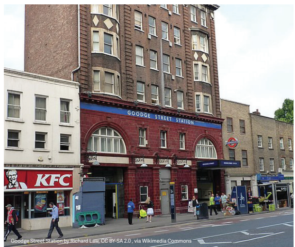
Goodge Street Station by Richard Law, CC BY-SA 2.0, via Wikimedia Commons