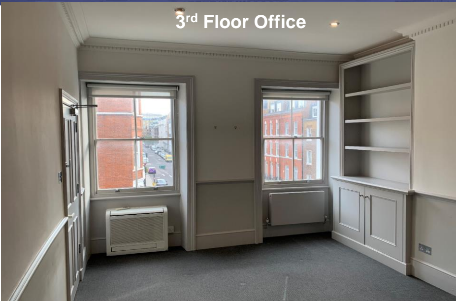
3 rd Floor Office