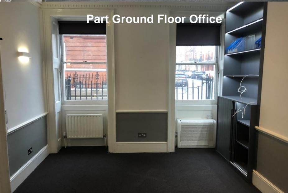
Part Ground Floor Office